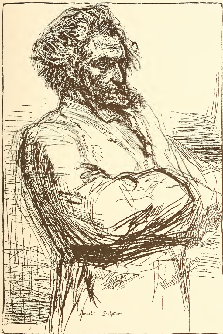
DROUET. (From the Etching.)